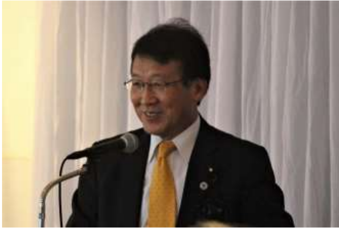
Keynote speech by Asahiko Mihara, Parliamentarian