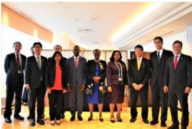
Speakers and panelists