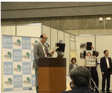
Statement by H. E. Mr. Yoshiaki Harada, Minister of the Environment, Japan