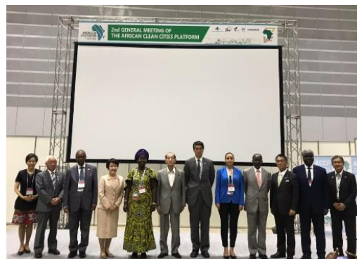
Group photo of Presenters of High-level session