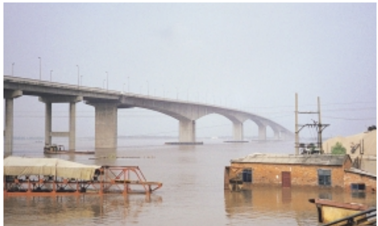
A General View of Huangshi Yangtze River Bridge