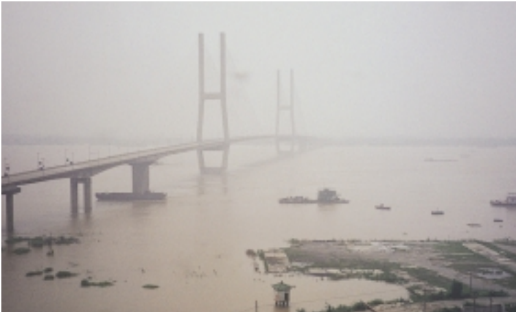
A General View of Tongling Yangtze River Bridge