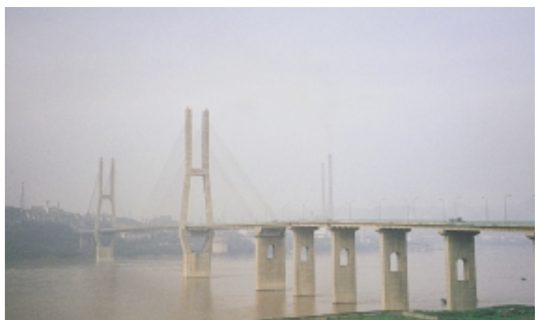
A General View of Second Chongqing Yangtze River Bridge