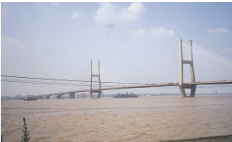
A General View of Second Wuhan Yangtze River Bridge