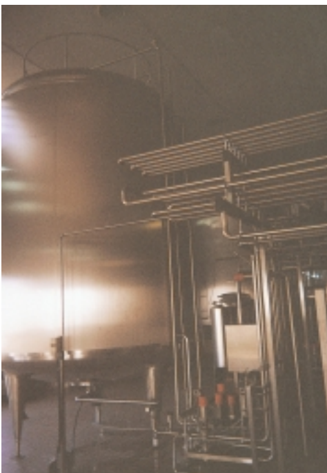
A Milk Processing Plant purchased and set up under this loan.