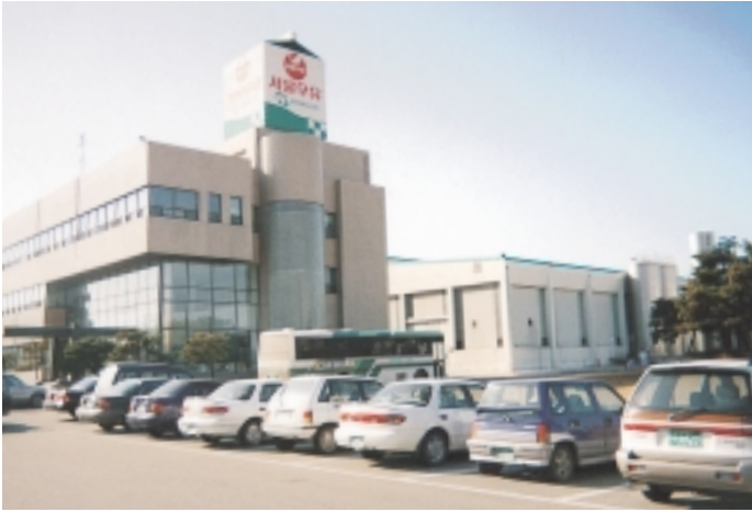
Seoul No.3 Factory (from Main Gate)