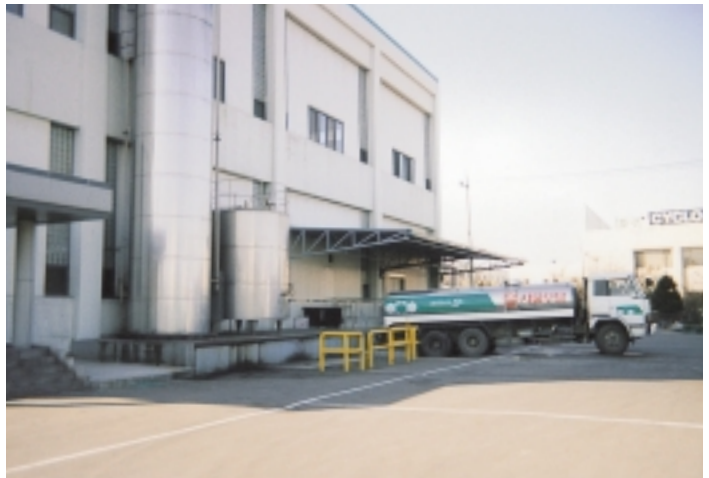
The Market Milk Processing Plant extended under this project.