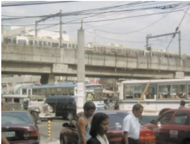
Light Elevated Railway (where it crosses EDSA)