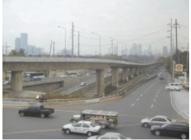
Flyover (EDSA - Ayala Avenue)