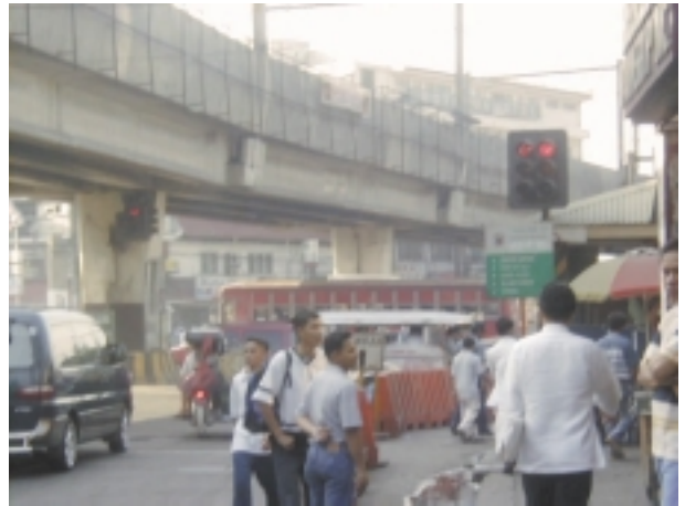
Signals Installed on the Junction of EDSA and Taft Avenue