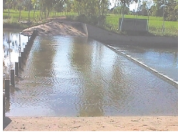
Ban Muang Noi Weir Facility