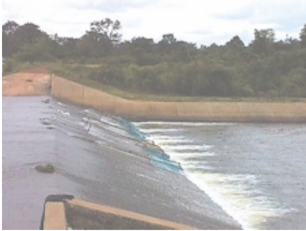
BanYang Kut Reservoir Facility