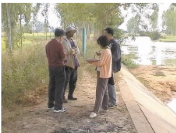
An Interview with Farmers