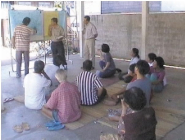
A Meeting with Villagers