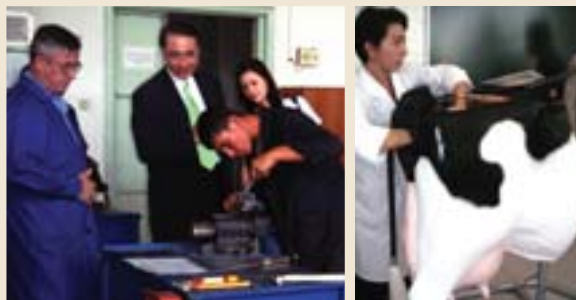
An agricultural mechanical engineering class (left) and a veterinary science teacher (right) in the schools which received educational equipments from the Senior Secondary Education Project. After receiving training at an agricultural school in Japan, this teacher began teaching classes, mainly through practical exercises.

In particular, the education project is one that is worth paying attention to because it sheds light on what ODA could be in the future, with its assistance for the hardware aspect of infrastructure installation and its assistance for the software aspect of human resources training. I must say that, overall, this project functions well, including the teacher training in Japan. Henceforth, I suggest that assistance for both components, people and things, be expanded to other developing countries through deepening cooperation with JICA, etc.