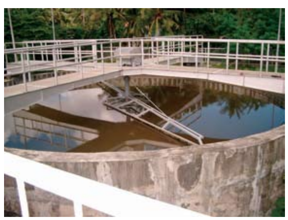
Sewage treatment plant developed by the project