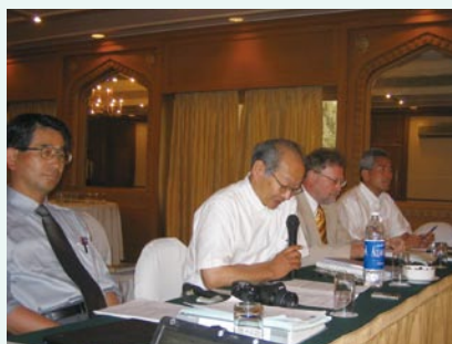
India: External evaluators participate in the "Ajanta-Ellora Conservation and Tourism Development Project" workshop (Tsukuba University)

Project," etc.), and Hiroshima University (Bangladesh "Area Coverage Rural Electrification Project (Phase 4-C)"). In FY2006, in addition to these universities, as shown in the table below, the University of Tsukuba and Senshu University also participated in evaluation activities. In addition to project evaluation by the five DAC evaluation criteria, each professor's expertise was also utilized to perform thematic evaluations.