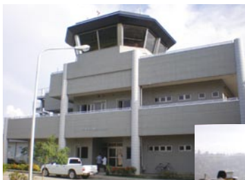
Traffic control tower at Caticlan Airport