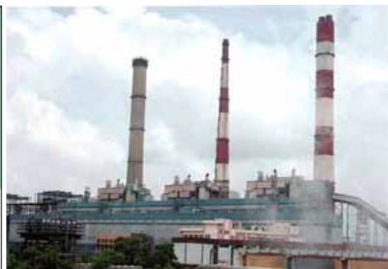
Bakreswar Thermal Power Station