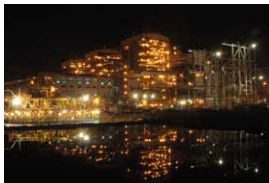
Night scene of the power plant reflected in the drainage basin