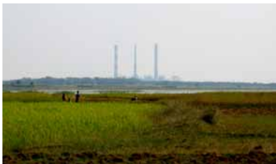
View of the power station from the reservoir catchment area

than 50%. As the school enrolment rate for local children has substantially increased, the number of pupils at the nearest schools (secondary and high schools) to the power station has trebled. Almost all of the people interviewed believe that the BkTPS has had a favourable impact on the education of local children while three-quarters believe that there has been a favourable impact on health care.