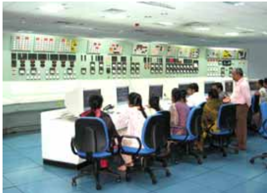
Training using the simulator