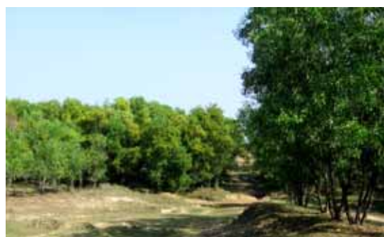
Tree planting in the reservoir catchment area

Emissions from the power station are well managed and all of the relevant emission standards are met. As a result, no negative impact on the environment has been found. 16 The catchment area (approximately 100 km 2 ) of the newly constructed reservoir used to be mostly waste land but the natural environment in this area has been improved due to planting over some 1,350 ha and the construction of irrigation ponds to the extent that water fowl are now seen in the area. 17