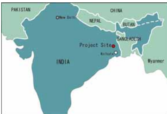
Project Site Location Map