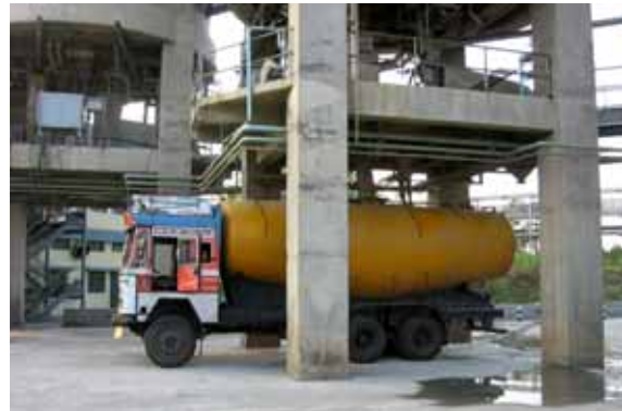
Loading of fly ash to a transporter