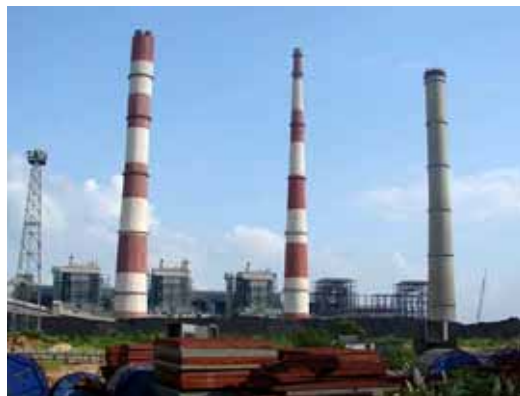
From left to right: stack for Units No.1 & 2, stack for Unit No.3 and stack for Units No.4 & 5 (under construction)

The raw water required for power generation primarily comes from the Tilpara Reservoir located 15 km away. The Bakreswar Reservoir (storage volume of 2.29 million m 3 and covering a maximum area of 10 km 2 ; outside the scope of the yen loan) has been constructed at a site some 3 km northwest of the power station as a back-up reservoir to supply raw water for a period of three months when water from the Tilpara Reservoir cannot be used.