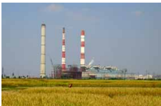
Irrigated rice cultivation adjacent to the power plant

Because of such excellent operation results, the BkTPS received a Meritorious Award for Low Oil Consumption and a Silver Shield for Overall Performance from the Government of India in 2003. The plant also received an Environmental Excellence Award from the Government of WB in 2002, 2003 and 2005.