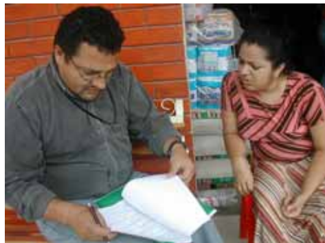
Figure 6: Beneficiary Survey