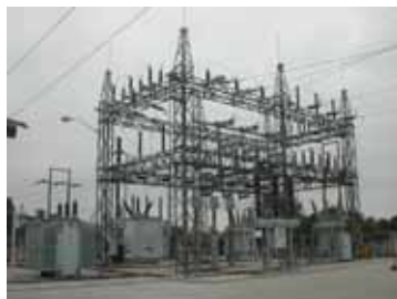
Figure 3: Montero Transformer Station