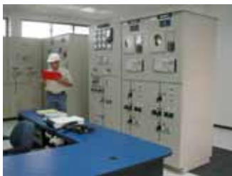
Figure 8: Daily Management inside a Transformer Station

With regard to the local distribution-related facilities of the Sub-Transmission (Phase B-2) Project, the local electric power companies are in charge of operation and maintenance, and operation and maintenance work is essentially carried out by specialized technicians at the local electric power companies or consigned to private firms. It was also confirmed that there are no problems in this operation and maintenance either.