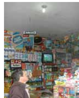
Figure7: Electrification of Stores