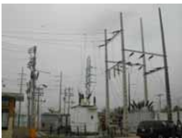
Figure 2: Duran Transformer Station