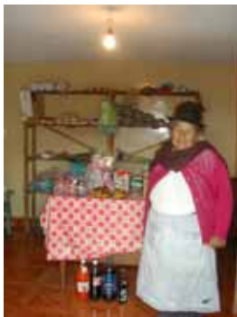
Figure 5: Electrification of Stores