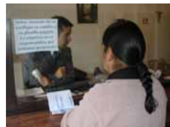
Figure 10: Fee Payment Location inside Electric Power Company