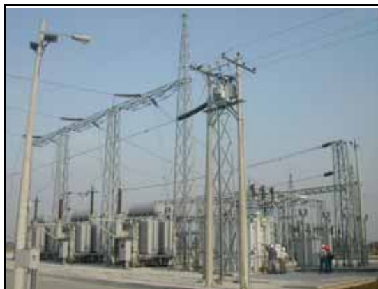
Dos Cerritos Transformer Station