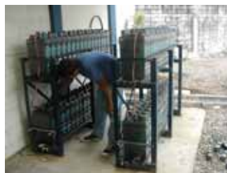
Figure 9: Inspection of Batteries