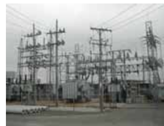
Figure 4: Milagro Sur Transformer Station