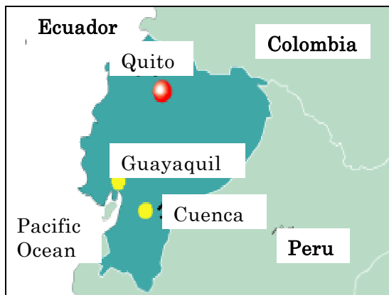
Map of project area: Entire Area of Ecuador