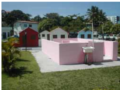
Figure 12: Model houses of the

Sedur won the “2006 UN Public Service Award” and Embasa won the “National Award for Sanitation Improvement”, showing that their operation and maintenance including the maintenance of facilities are appreciated both at home and abroad.