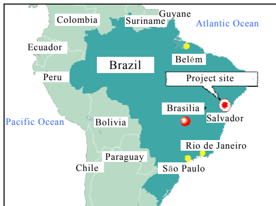
Map of project area