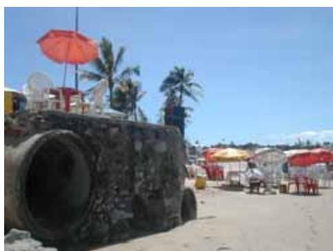
Figure 5: Sewage outlets that used to discharge sewage to the bathing beach before the project