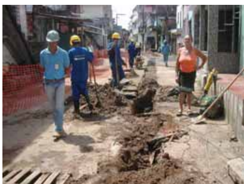
Figure 10: Construction of branch pipe and drain

The technical level of each private contractor that actually performs the operation and maintenance works is checked when entering into a contract. In addition, Embasa provides complementary technical training to private contractors using the training manual it developed to maintain the required technical level.