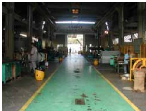
Figure 13: Electrical system repair