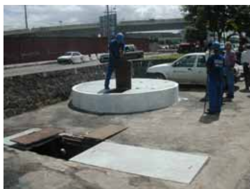
Figure 11: Pumping station and operation/maintenance workers