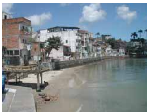
Figure 6: The bay coast free from discharge of household sewage