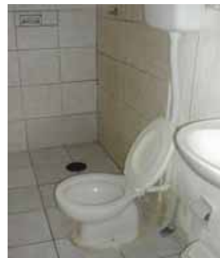
Figure 9: Toilet and wet area facilities installed after the construction of the sewerage system