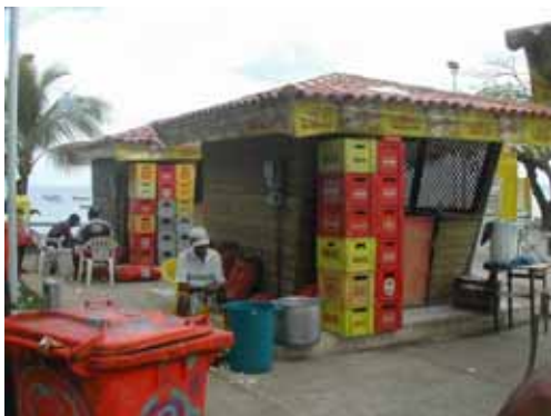
Figure 8: Kiosk constructed on a bathing beach with the support from the administration