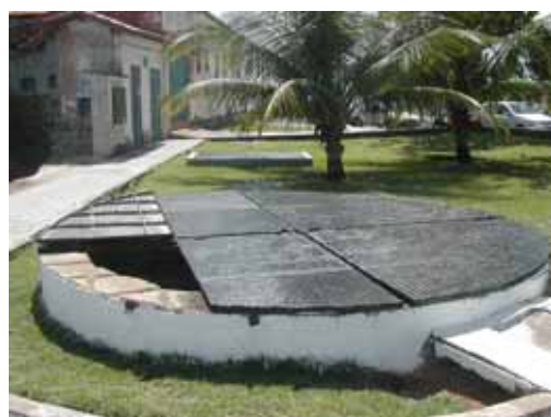
Figure 3: Pumping station