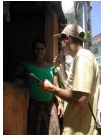
Figure 7: Beneficiary survey in the district where sewerage system was constructed