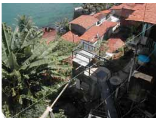
Figure 2: Water supply network in the residential area along the coast