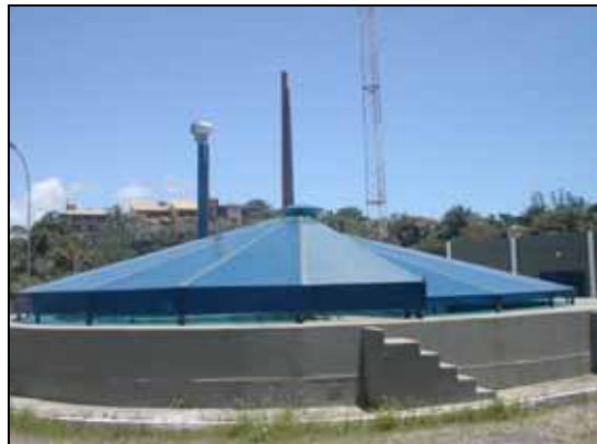
Pumping station equipped with environment-conscious treatment function