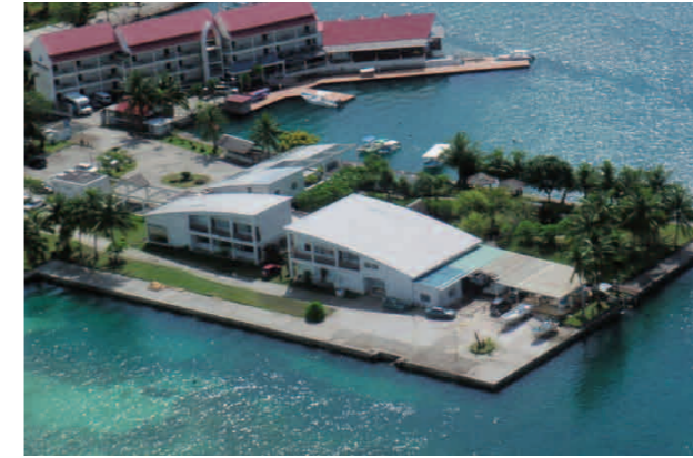
Palau International Coral Reef Research Center

For this reason, the restoration of coastal disaster prevention forests that were affected in the Great East Japan Earthquake is under way in Japan now; whereas it is also necessary to develop coastal disaster prevention forests in developing countries beforehand and include the restoration of coastal disaster prevention forests in recovery and reconstruction plans in the event of disasters, incorporating the perspective of Eco-DRR.