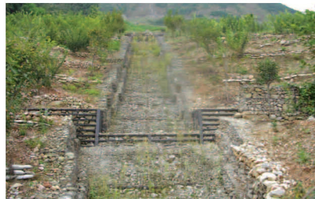
Japanese products (steel frame retaining wall) are utilized for the restoration