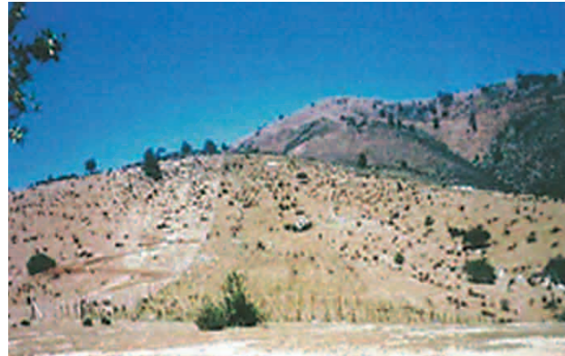
Implementation of Chisan project in degraded watershed forests (Chile)

The decline in watershed protection functions due to the loss or degradation of watershed forests surrounding dams and canals has become a problem in Latin American countries. For this reason, JICA carried out watershed management projects in these countries, and further disseminate outcomes of technology transfer to neighboring countries through the third-country training with the aim of improving the disaster management capability of the whole region. The participation of people living in watershed areas in forest management activities is essential for such watershed management projects. Project activities do not only enhance functions of watershed forests but also improve communities' resilience, which are helpful for community-level disaster risk reduction.