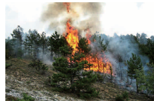
Loss of forests by a wildfire

Large-scale forest fires occurred in Former Yugoslav Republic of Macedonia in 2007, where the national emergency declaration was issued for 14 days. Thus the Government of Macedonia planned an capacity development of its crisis management center for prevention and early warning of forest fires. JICA helped build a mechanism of risk assessment for forest fires and a system for their prevention and early warning through the TCP for three years from 2011. This system does not simply contain the prevention and early warning of forest fires but also forest resource information to promote sustainable forest management, contributing to the preservation of sound forest ecosystems with a lower risk of generating forest fires. In addition, there is a plan to promote the dissemination of such technologies at a regional level by the third-country training from 2015, as this system attracts attention of neighboring countries that are facing similar damages by forest fires.