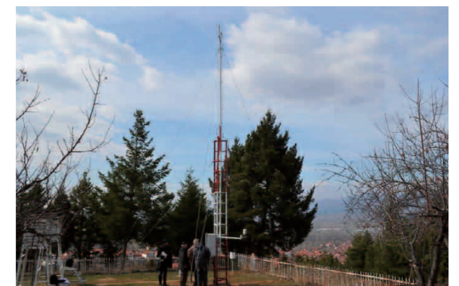
Weather observation facility for prevention and early warning