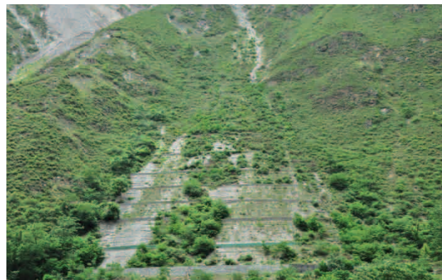
The restoration progresses with Japan's Chisan technologies

The Sichuan Earthquake that occurred in Sichuan Province in 2008 caused a great deal of damage to forests as well. Thus JICA has supported the restoration of forests with higher disaster prevention functions than ever by introducing Chisan technologies through the TCP and also facilitated the "building of a more disaster-resilient society" (Build Back Better) such as the planting of fruit trees with the aim of improving local communities' livelihoods in the restoration of damaged forest cover and their participation in restoration programs to help strengthen communities' resilience. Furthermore, focusing attention on the outcomes of the project, the Government of China aims to proactively make its investment in disaster risk reduction as a national policy by stipulating " Chisan " in its Forestry Law as well as the policy of "Conversion of Cropland to Forest Program" (large-scale afforestation program) that has served as the driving force for forest area recovery in China and accordingly throughout Asia until now. The project has also contributed to the "establishment and strengthening of disaster management system" of the Government of China.