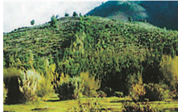
Forest functions were improved seven years after tree planting (Chile)