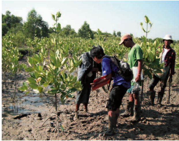
Mangrove afforestation under the TCP