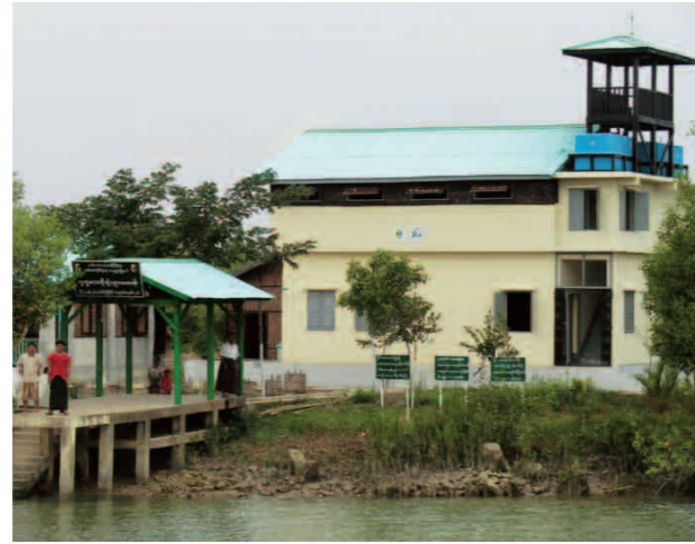
Forest monitoring tower with evacuation facility