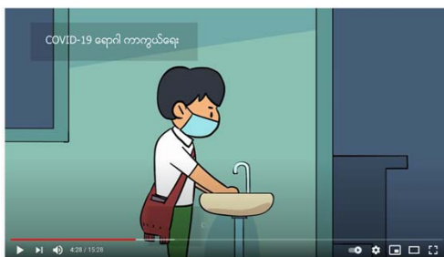
< Awareness message for teachers >

"Make sure children wash their hands every time they enter the classroom."