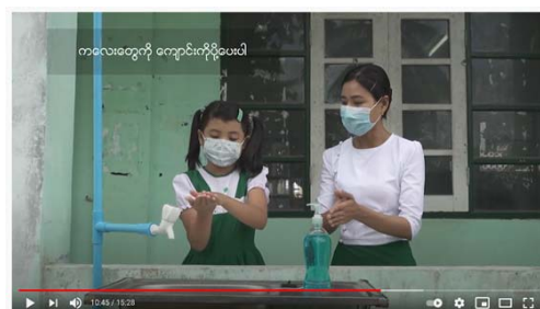
< Awareness message for parents >

"Make sure children wash their hands every time they enter the classroom."