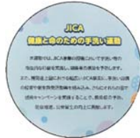
The reverse side introduces the hand-washing campaign