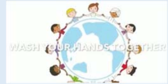
Central and South America (several countries) 「WASH YOUR HANDS TOGETHER」

In addition to the videos, other deliverables are also introduced on the JICA Platform for the introduction of hygiene awareness tools . Please take a look and make use of them.