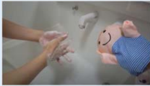
Egypt 「How do we wash our hands?」 (Arabic)