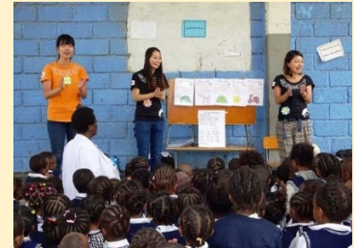
Handwashing awareness activity at a kindergarten

Although my assignment has finished, I would like to learn from the Early Childhood Education Corps members and continue my efforts to help Ethiopian people from Japan.