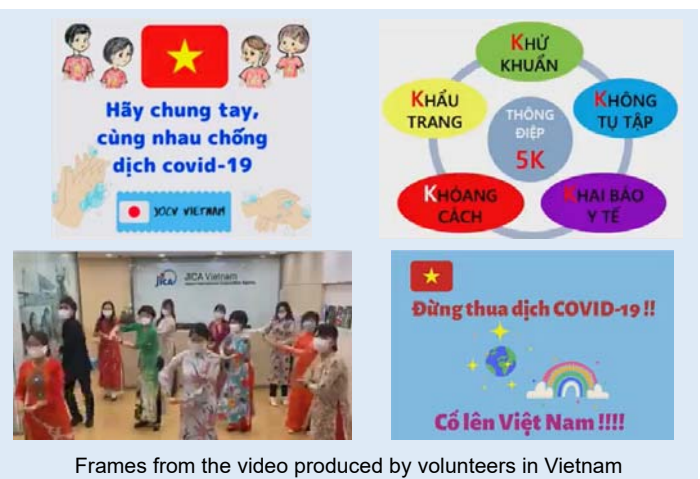
Frames from the video produced by volunteers in Vietnam

We would like to take this opportunity to introduce you to some of the volunteers who have produced and released awareness raising videos while in Japan. If there is a video from a country that you are connected to through your work, please watch it and help us spread the word about our activities through various opportunities.