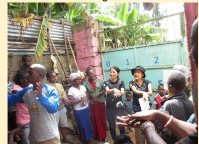
Handwashing awareness activity at a NGO