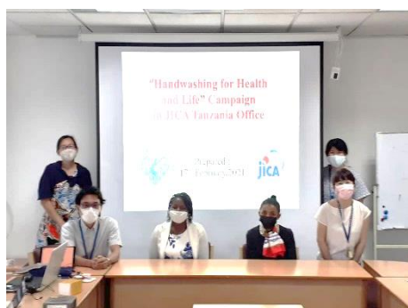
Handwashing campaign task team in the office

In order to promote the "Handwashing for health and life" campaign, the JICA Tanzania Office gathered members from each group in the office to form the Handwashing Task Team, which is engaged in activities such as the dissemination of handwashing awareness materials for each project, public relations activities, and measures to prevent coronavirus infection in the office.