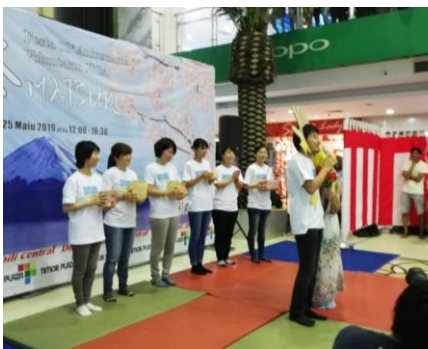
Handwashing play (handmade soap was distributed to participants after the play)

In Timor-Leste, a small country with a population of about 1.2 million, we hope that the commemorative events and social networking sites have helped to spread the word about "Fase liman ho sabaun".