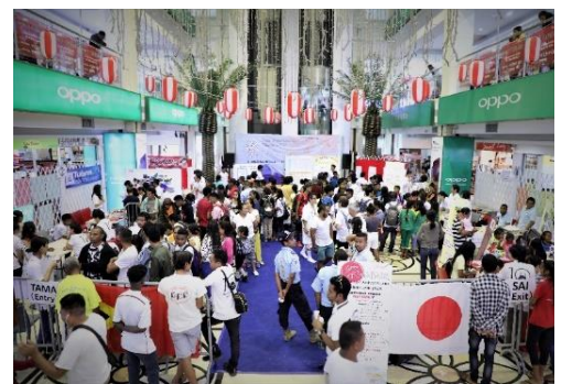
Scene from the event

Note: The event in the photos took place in May 2019, before the spread of COVID-19.