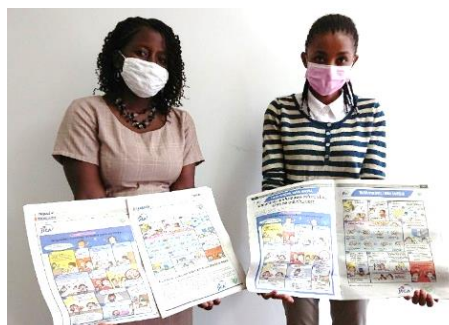
"Correct handwashing" in a local newspaper