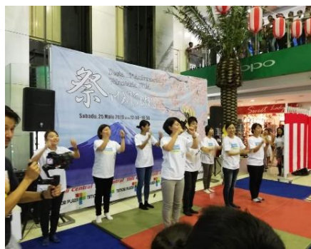
Song and dance performance of "Fase liman ho sabaun"