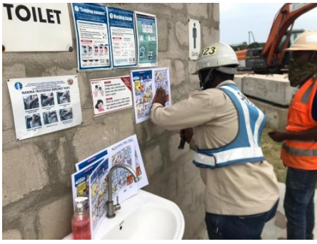
Handwashing awareness raising at a construction site for a grant aid project (Sumitomo Mitsui Construction Co., Ltd.)

than 600 inquiries on the same day, and the total circulation of the four newspapers was about 150,000. It is possible that the newspaper reached about 1.5 million readers. There were a lot of generous comments and responses from readers all over the country, including in rural areas. In addition, the office has been promoting handwashing awareness among counterparts by distributing “correct handwashing”, of which 5,000 copies are available, mainly in Swahili, at events and workshops for each project.