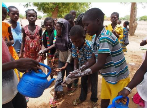
Children washing their hands with lathered soap and rinsing their hands with running water from a kettle.