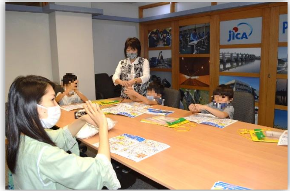
(To protect privacy, part of the photo has been altered.)

In this experience, a second grade student said, "I wash my hands often because washing my hands prevents me from diseases and COVID-19. When I wash my hands, I try not to waste water."