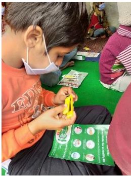
Awareness raising activities

KAI India, a leading manufacturer of cutlery products, participated in the "Achhi Aadat (Good Habit) Campaign" initiated by the JICA India Office to raise awareness of hygiene habits in order to prevent the spread of COVID-19. We provide the KAI Tsumekiri, a nail picker designed for use in India, to promote awareness of nail cleaning, and distribute flyers and employees visit local communities to instruct people on how to cut their nails properly.