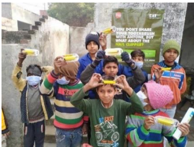
Distributing tsumekiri to schools 1