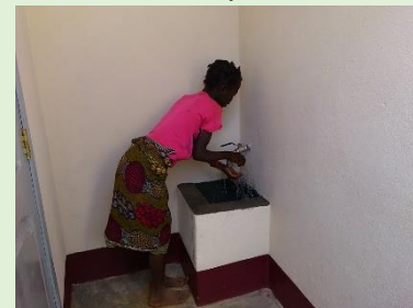
Handwashing station in the elementary school sanitation facilities (toilets) constructed in The Project on Promoting Sustainability in Rural Water Supply, Hygiene and Sanitation in Niassa Province in the Republic of Mozambique