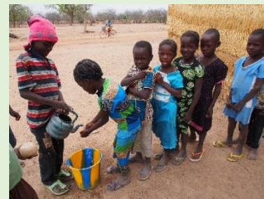
Handwashing before school lunch at an elementary school