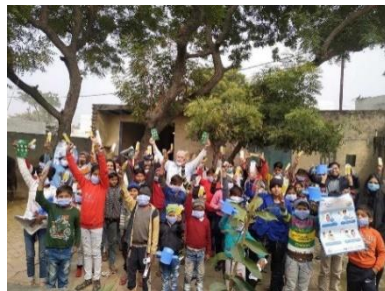
Distributing tsumekiri to schools 2