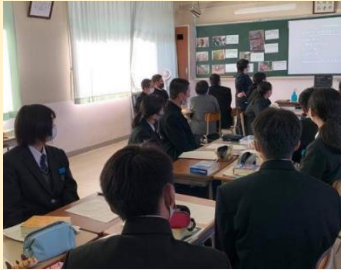
Classroom using video materials