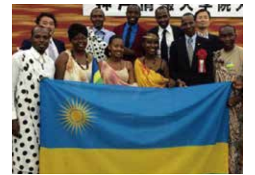
ABE Initiative participants from Rwanda enrolling in KIC.

Kobe City's approach is one of the good practices where the local government takes the initiative to support industrial development of Africa with collaboration with their local private sector and universities.