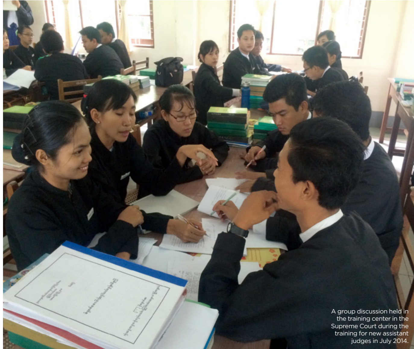
A group discussion held in the training center in the Supreme Court during the training for new assistant judges in July 2014.