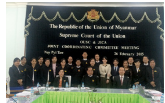
In February 2015, a meeting was held to review the work and make an annual plan at the Supreme Court in Nay Pyi Taw.