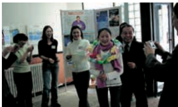
The moment when the Japan Center in Mongolia recorded its 30,000th visitor after opening on February 27, 2003

Also, the need for proper protection and management of the valuable natural resources found throughout Mongolia's vast land expanse has become heightened along with greater interest in international conservation, namely, biological diversity* and global warming issues. JICA will explore possibilities for cooperation in this environmental conservation area.