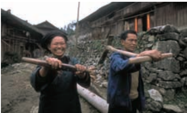
Poverty program project implemented with the cooperation of a Japanese NGO in Guizhou Province

With its incorporation into the economic sphere of the Council for Mutual Economic Assistance (COMECON) in the 1920s, Mongolia began to serve as a supplier of raw materials, and mining and light industry as well as livestock-farming and agriculture started to develop. Another characteristic of this country was its level of basic living conditions (such as education and medical care), which was higher than that of other developing countries, thanks to substantial economic