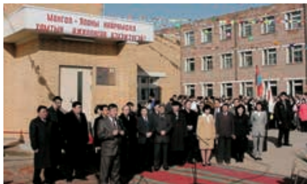
Opening ceremony of an elementary school in Mongolia built with the support of Japanese ODA

However, lack of funds has created difficulties in maintaining and managing a wide range of socioeconomic infrastructure, and repair and renovation of this infrastructure have become important tasks. The development of human resources needed for the market economy is another urgent priority. Further problems that have surfaced recently include