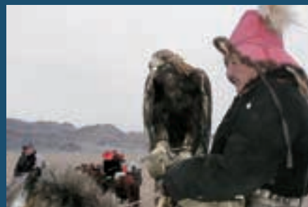
A Kazakhstani falconer living in western Mongolia

Experts held a workshop in a gel (the nomadic tent house) to encourage the participation of residents. Falconers shared their experiences in the workshop, and experts provided technical assistance, including data sheets for research into habitat conditions. As a result, some local NGOs such as the Wolf Preservation Association and the Golden Eagle Preservation Association were founded. Data collected by these associations will be stored at the Ministry