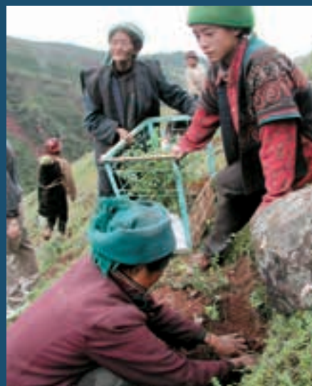
Local ethnic minority people participating in the afforestation project

Since most of the experts' activities take place not in an office but on site,