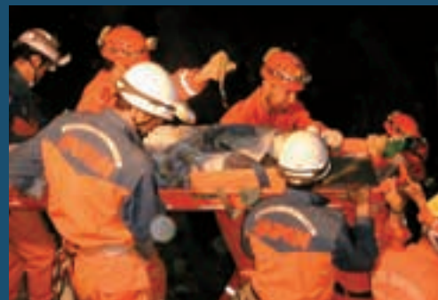
Japanese and Turkish rescue teams saving a survivor

Approximately two hours after the rescue operation started, a space was finally created among the rubble, and the survivor was sighted. He was given some water, and a Turkish doctor went into the hole to give him an I.V. drip. The Japanese team waited with a stretcher.