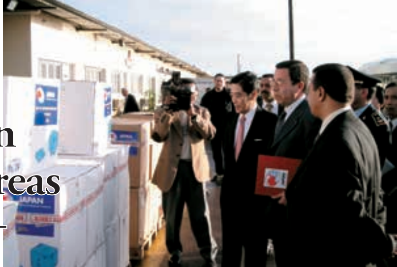
Emergency relief supplies for a flood disaster in Morocco (Provision of materials)