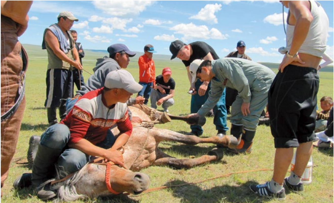
Mongolia: A JICA expert supervises a method to treat a horse as part of the effort to foster veterinarians to protect nomadism (Project for Strengthening the Capacity for Human Resource Development in the Field of Veterinary and Animal Husbandry)