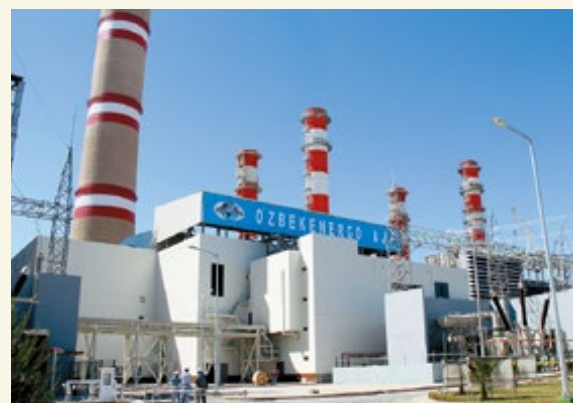
Talimarjan Thermal Power Station, a core thermal power station in Uzbekistan

In these power stations, new combined cycle power plants (CCPPs), which are capable of generating electricity at higher efficiency and lower cost, have been implemented. However, since human resources capable of operating and maintaining the latest power-generating facilities are lacking, through technical cooperation JICA supports creation of a training system at training centers for power-plant engineers. As a part of this effort, about 10 people from Uzbekistan, including engineers, participated in training in Japan in February 2017 to develop their understanding of the power generation industry and equipment in Japan, through their visits to power plants and equipment manufacturers in various areas over the course of about a month.