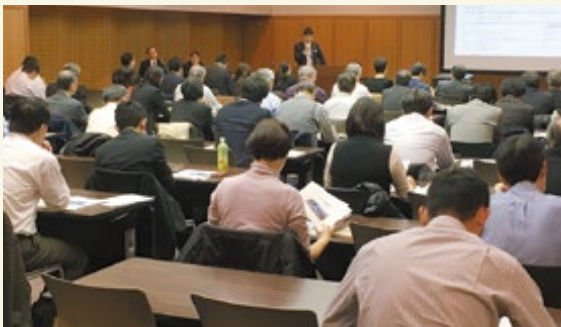
At the seminar held in Tokyo, many participants from various business sectors listened attentively to a report on the study.

the Uzbekistan-Japan Center for Human Development; and (3) improving agricultural infrastructure, which raises income levels in rural areas, and expanding and improving health care.