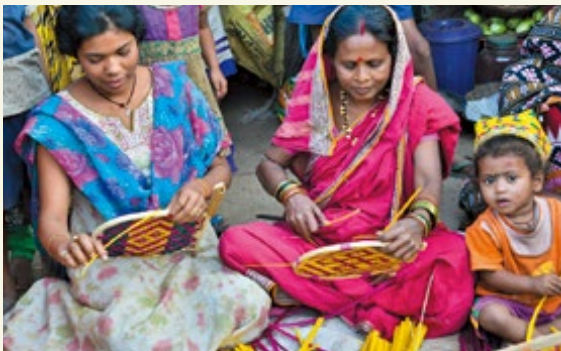
Livelihood improvement activity in Phase 1 (basket-making). This support will be expanded in Phase 2.

In Phase 2, to expand livelihood improvement activities by women's groups, JICA plans adding components to enhance financial support and outlets for products. As a good model for conservation of biodiversity and human well-being, a Japanese landscape model (SATOYAMA concept) will be adopted in the project. Through these initiatives, JICA will implement JFM in 1,200 villages, and aim at planting 5,700 hectares of land and improving household income by 15%. The outcome of the challenge in Odisha State is expected to spread over the state boundaries and spread nationwide.