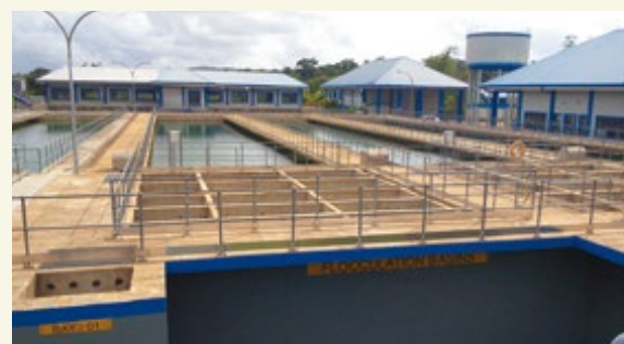
Kandana Water Treatment Plant in Kalutara District, expanded through ODA Loans

By incorporating various schemes in comprehensive and effective ways, JICA will continue to contribute to the improvement of the surrounding environment for the sustainable growth of Sri Lanka.