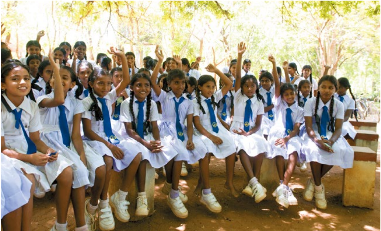
Sri Lanka: Children from banana-producing farms at a school in a target area of the irrigation upgrading and extension project