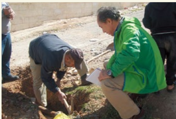
Yarmouk Water Company (YWC) officials check leakage from water pipes.

Particularly in the northern part of the country, close to the nation's border with Syria, while the water supply and sewage systems are deteriorated and have leaks and other problems, operations exceeding the capacity have continued to meet the rapidly growing demand for water due to the large influx of refugees, thus resulting in severe stress on public water facilities. Even some friction was seen between Syrian refugees and local Jordanian residents in getting the limited amount of water. So, first focusing on the water and waste water services in the northern region, JICA provided support for the formulation of development plans with the target year set for 2035. JICA furthermore conducted emergency maintenance and repairs of the water facilities as well as provided training of repair work. The designed development plans have been highly evaluated by the Jordanian government and other donors, and various projects have been carried out in line with the development plans. It is expected that these support activities will effectively respond to water demand in refugee-receiving regions as well as contribute to peaceful coexistence between host communities and refugees.