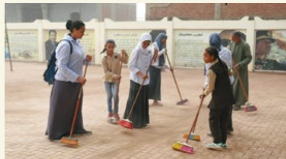
Students of a Giza primary school clean the school grounds as maintenance and management work of school facilities is a step to learn how to live with others and work cooperatively.

Through these support efforts, based on the strengths of Japan's education system, it is expected that the capacity of young Egyptians will be improved in order to contribute to the stabilization and development not only of Egypt but the entire Middle East region.