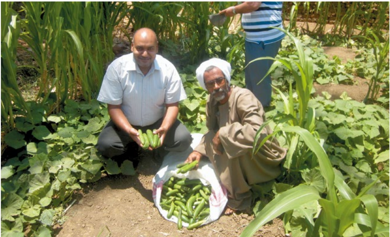
Aiming to improve livelihoods of smallholder farmers in Egypt, JICA is supporting the improvement of yield and quality of vegetables.