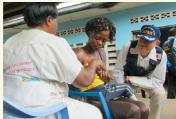
Checking the procedure of the vaccination campaign

JICA has carried out several projects and supported activities in the health care sector in the DRC for a long time, including helping develop health workers and establish public health systems. Such efforts finally made it possible to provide seamless support that combines cooperation during peacetime with emergency assistance for an infectious disease epidemic. Going forward, JICA will continue to combine its projects with emergency assistance to provide seamless support that meets the needs of each country.