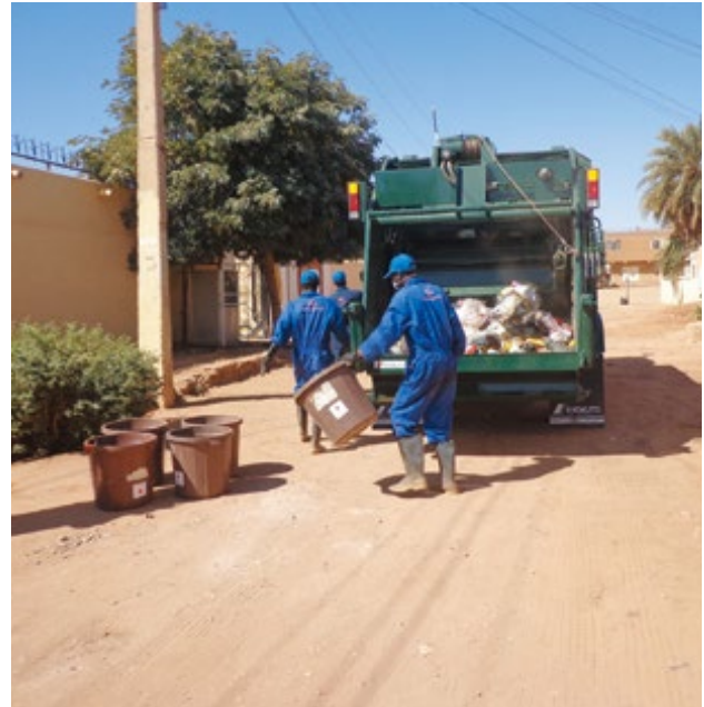
Garbage collection vehicles that have been provided to Sudan with grants are decorated with stickers featuring Captain Tsubasa , a Japanese anime program that has been broadcast from the early 1990s in the country and is widely popular among children and adults alike. Along with JICA's cooperation, Captain Tsubasa plays a part in building a garbage collection system that can win cooperation from local residents.

There are three categories in this type of Grant: