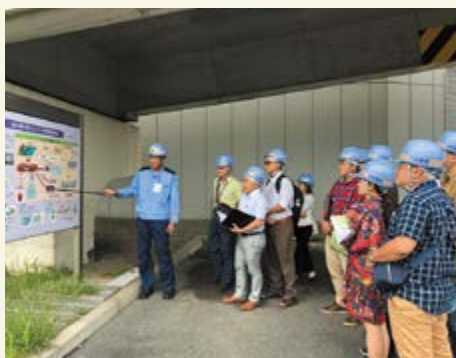
Ho Chi Minh City officials being briefed at a water reclamation center of the Tokyo Metropolitan Government

The United Nations Framework Convention on Climate Change (UNFCCC) calls for developing countries to take Nationally Appropriate Mitigation Actions (NAMAs) aimed at reducing the emissions of greenhouse gases (GHGs) and delivering on the Paris Agreement from 2020 onward. This project supported the formulation and implementation of such actions in Viet Nam.