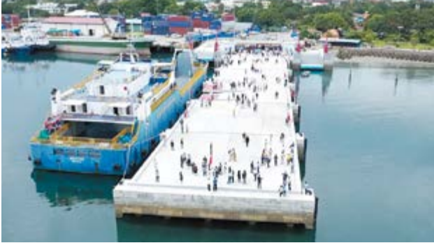
Timor-Leste: At Dili Port, which serves as the only international port in the country, the existing ferry terminal was relocated and expanded to separate passenger and cargo sections under a Grant project. Completed in October 2019, the renovated terminal is now contributing to the expansion of safe and efficient marine transport in Timor-Leste.

in which purposes and expense items are not specified, and “sector budget support,” in which purposes and expense items are limited to a certain sector.