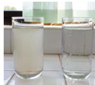
Untreated raw water (left) and treated water (right) JICA has long been supporting the supply of safe water in Cambodia, a most notable example being the development of the Phum Prek Water Treatment Plant in Phnom Penh. Tap water in the capital now meets the drinking-water quality standards of the World Health Organization (WHO).

By implementing Grants with Operation and Management, JICA will support the overseas application of Japanese technology in the O&M and other aspects of public infrastructure and the like, thereby contributing to quality public service delivery in developing countries.