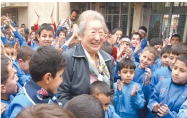
Mrs. Ogata, on her visit to a refugee camp school in Aleppo, Syria, in March 2008