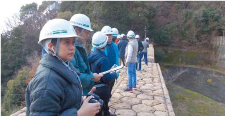
Program participants observing an erosion and sediment control structure ( sabo ) in the Mt. Rokko area of Hyogo Prefecture as part of the Knowledge Co-Creation Program on Comprehensive Disaster Risk Reduction

January 17, 2020, marked the 25th anniversary of the Great Hanshin-Awaji Earthquake. In 2007, JICA and Hyogo Prefecture jointly established the Disaster Reduction Learning Center (DRLC) within JICA Hyogo (now JICA Kansai Center) as a hub for effectively developing human resources engaged in BOSAI or disaster risk reduction (DRR) in developing countries. To date, DRLC has accepted more than 3,000 program participants from 121 countries, providing them with Japan's BOSAI knowledge, including the lessons learned from the Great Hanshin-Awaji Earthquake, as well as the experience gained in coping with the disaster. JICA will continue to share Japan's DRR experiences with the world with a view to achieving the Sendai Framework for Disaster Risk Reduction 2015–2030.