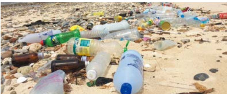
Marine plastic waste washed ashore in Thailand

Marine plastic pollution has recently been in the spotlight as a serious global environmental issue that requires urgent countermeasures. As its first attempt to resolve this problem squarely, JICA agreed with a Thai government agency to conduct a science and technology cooperation project aimed at assessing the state of marine plastic pollution in Thailand. Under the project, research institutions in the two countries will tackle addressing this problem through joint research designed to assess the pollution and build a framework of monitoring in the Southeast Asian seas.