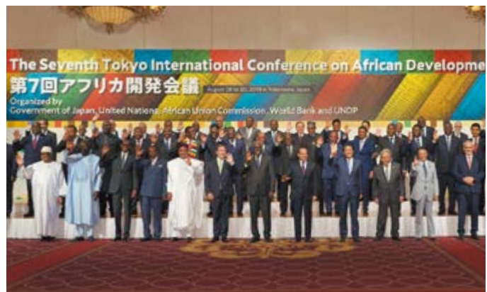
TICAD7 was the first TICAD held in Japan in six years.

TICAD7 brought together delegations from 53 African countries, including 42 African leaders, to Yokohama, Japan. Co-chaired by then Japanese Prime Minister Shinzo Abe and Egyptian President Abdel Fattah El-Sisi, TICAD7 adopted the Yokohama Declaration as the main outcome document. The Japanese government announced a list of public-private actions for the next three years to support African development, titled “TICAD7: Japan’s Contributions for Africa.” Based on this list as well as the Yokohama Declaration, JICA will forge ahead with its cooperation for the development of the continent [ → see “Africa” on page 32].