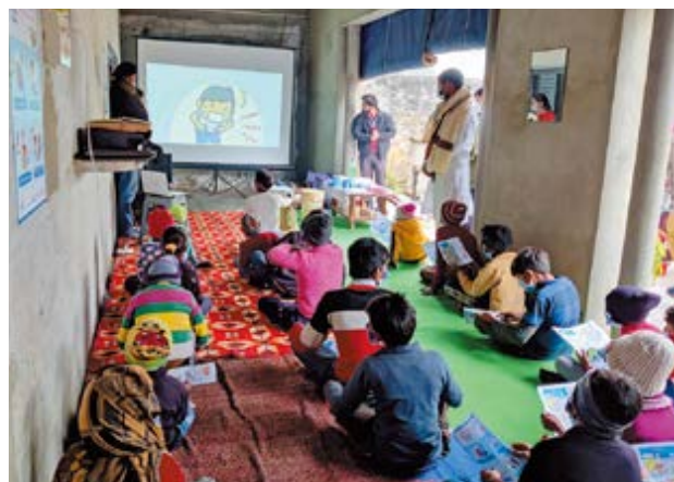
India: To prevent infectious diseases, JICA has been implementing the "Achhi Aadat (Good Habit) campaign," designed to encourage hygiene practices such as handwashing, nail hygiene, and wearing masks in the correct way. A Hindi-dubbed video version of the animated "How to Wash Your Hands Properly" is introduced in the campaign.

In fiscal 2020, JICA's cooperation for the region focused on