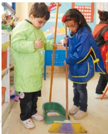
Egypt: A scene at an Egyptian Japanese School (EJS). JICA supports local primary schools in introducing the Japanese model of holistic education as represented by Tokkatsu (special activities) such as classroom discussions, Nicchoku ("Daily Coordinator" in which each student will be assigned in turn, as a leader, to do some work for the entire class), and classroom cleaning.