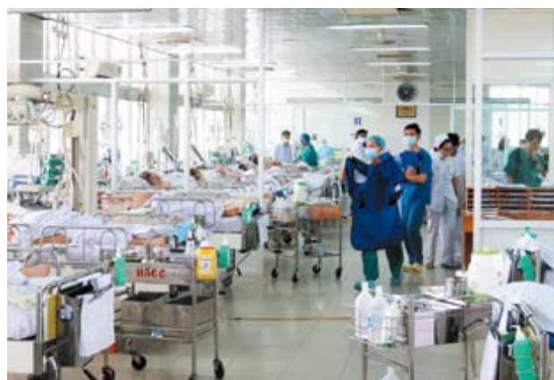
Viet Nam: An intensive-care unit of the Cho Ray Hospital, the largest medical facility in southern Viet Nam. JICA worked on the return of its project partners to their countries of assignment after making necessary arrangements, including assessing the situation of health care institutions in each country to prevent COVID-19 infection.

Against this backdrop, JICA worked on and developed three frameworks of its own for forging ahead with its operations that entailed international travel, while ensuring safety and health of its partners.