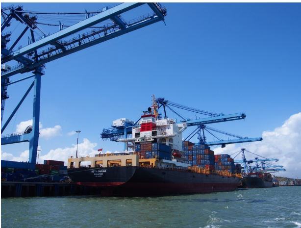
Mombasa Port Development Project-phase (2) in Kenya

Official Development Assistance (ODA) is the support provided by governments to promote the economic development and welfare of partner developing countries as described by Organization for Economic Co-operation and Development (OECD). After World War II, Japan was a recipient of ODA to recover its economy. However, while being a recipient, Japan already began development assistance to other countries by joining the Colombo Plan in 1954 with the aim of war reparation and demonstrating its goodwill.