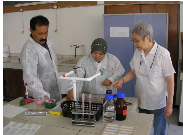
Technical Cooperation on Tuberculosis Control Project in Indonesia

JICA, as the ODA executing agency of Japan, has been playing a very significant role in development assistance around the world by providing cooperation through various approaches in forms of technical cooperation, concessional loans and grants and volunteer activities.