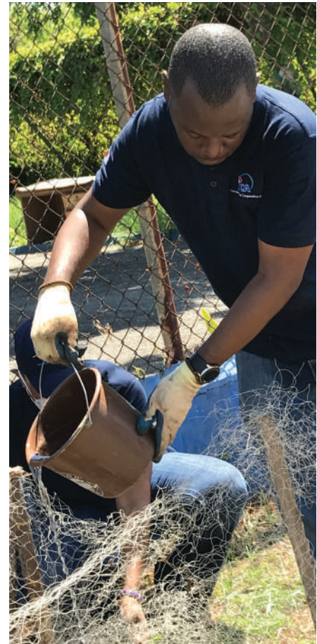
Tree planting at the Paradise Basic School with student, principal, parent and community members