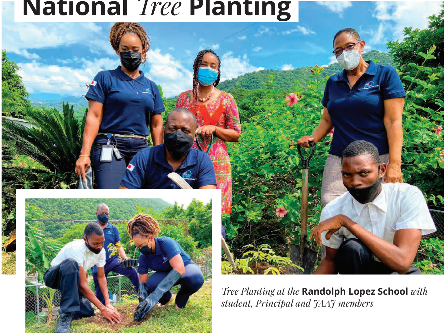
Tree Planting at the Randolph Lopez School with student, Principal and JAAJ members