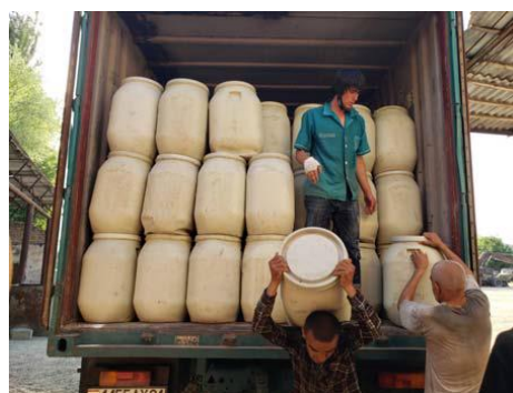
Figure 1: Tons of Chlorine procured by JICA as Support to Tajikistan in the Response Phase

For example, as reported by Curtis and Cairncross (2003), handwashing with soap and water can reduce diarrheal diseases by 47 percent, one of the main objectives of the Water, Sanitation and Hygiene (WASH) is to "improve public health and ensure healthy living conditions." Therefore, building on the understanding of WASH's fundamental contribution to people's health, it is essential to examine measures to prevent the spread of COVID-19, especially with vulnerable groups, and to strengthen the response in terms of WASH. Furthermore, there is a need to identify countermeasures for water utilities that are severely affected and promptly implement them.