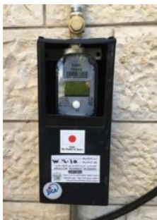
Figure 3: Photo of a Pre-Paid Water Meter

There may be an argument that the PPWM is forcing payment from the vulnerable groups and the poor whose incomes are affected by COVID-19, or, the poor cannot afford to charge it so they have difficulty in obtaining potable water. Given these situations, Jenin allowed customers, based on the application, to defer payments and make water available.