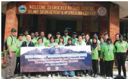
TCTP in October 2011 (participants from 11 countries)

ITBC-UMS was in charge of the implementation of TCTP with the support of other BBEC II member agencies including SaBC. The outline of TCTP with five modules is listed in Table 4. The main message delivered in the training course was the importance of “integration” of various activities in biodiversity conservation. It was composed of lectures, seminars, and field visits to various types of ecosystem, with different agencies introducing a variety of practical conservation activities. Throughout the training, the importance of developing a durable mechanism for interagency coordination for synergy was addressed. A total of 55 trainees from 16 countries were invited to Sabah in three years.