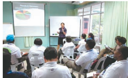
Lecture in a classroom