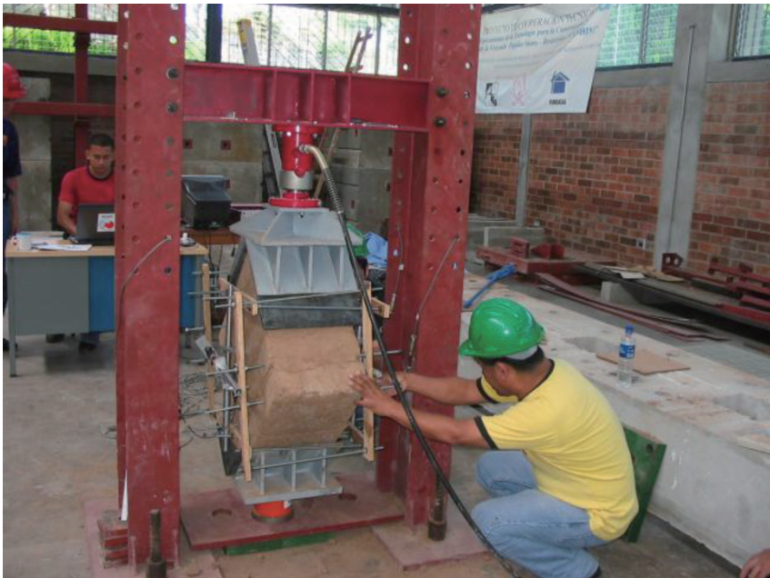
Diagram 2: Photo showing the experimenting on the seismic capacity of a brick

Due to the relatively long period taken for formulation and preparation of this triangular initiative, the main activities actually started in late 2003. Nevertheless, its launch was timely as the government introduced the “Safe Country: Plan of Government of El Salvador 2004-2009” (País Seguro: Plan de Gobierno 2004-2009) in the following year, which advocated for the adequate provision of housing with the clear government roles in tackling the challenge such as the formulation of a new housing policy, strengthening of housing standards and regulations, a new loan scheme for informal sector and the land entitlement, especially for the poor. The arrival of the five-year plan document of “Safe Country”, which emphasized the housing issues, further enhanced the policy relevance of the Taishin initiative.