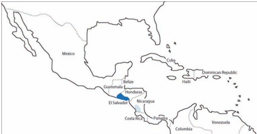
Diagram 1: Map for the Country in Scope of the Project