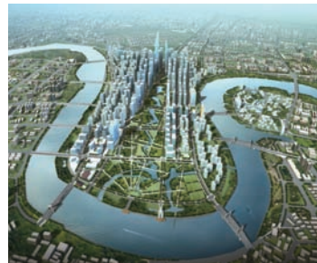
An image of the Tianjin Eco-City

China's rapid industrialization in recent decades has resulted in an equally rapid urbanization, as rural laborers seek new opportunities in the country's numerous cities. Yet, in tandem with China's new economic developments and rising living standards, environmental pressures, such as resource depletion, waste management, and, most noticeably, air pollution, have emerged. Given the