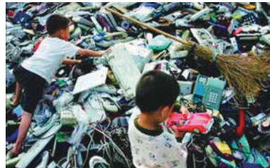
E-waste dump sites

the burning of cables to liberate copper, and of plastics to reduce waste volumes. The open burning of cables is a major source of dioxin emissions, a persistent organic pollutant that travels over long distances that bio-accumulates in organisms up through the global food chain.