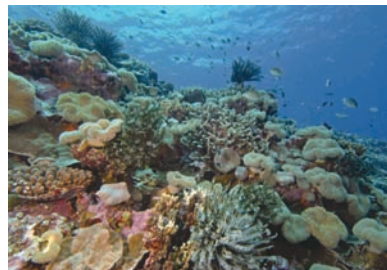
An underwater scene from the Coral Triangle

To address these challenges, countries in the region have sought advice and assistance from their neighbours, as well as international donors and organizations, and formed what is now known as the Coral Triangle Initiative on Coral Reefs, Fisheries, and Food Security. The six participating countries of this initiative — Indonesia, Malaysia,