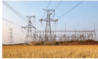
Transmission lines in Kenya

The Cogen for Africa initiative is supported by a group of international organizations, including the African Development Bank, Global Environment Facility and UNEP, as well as the Kenyan non-government organization, Energy, Environment and Development Network for Africa (AFREPREN/FWD),