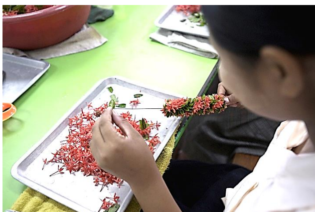
Training in the project on Strengthening MDT for Protection of Trafficked Persons in Thailand

of linkages among organizations in Thailand and neighboring countries and to make Thai and foreign victims smoothly transferred to their own countries and socially reintegrated. Participants of the workshops came from multiple stakeholders and shared experiences and challenges in each country. They also prepared a handbook for on-site personnel to assist the victims' repatriation.