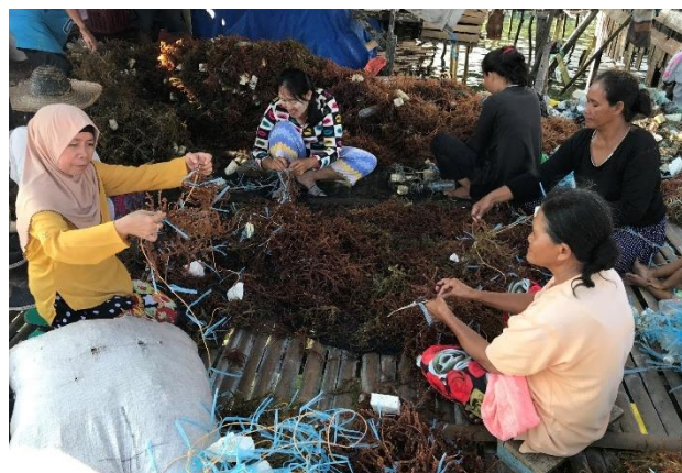
Typical seaweed farming family in the project on Comprehensive Capacity Development Project in Mindanao

guidance in agriculture by experts of the International Rice Research Institute and government agricultural extension officers was made possible in the area controlled by the Moro-Islamic Liberation Front (MILF), where government officials were previously unable to enter. This type of assistance developed the capacity of people in Mindanao and helped its residents enjoy the dividends of peace.