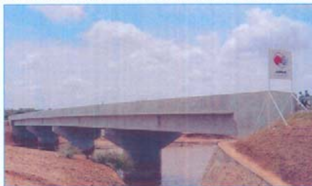
The new Ikutha bridge has improved transportation in Eastern Province.

Development and maintenance of Kenya's economic infrastructure is one of the country's most important requirements. Rapid population growth, inequitable distribution of resources, slow development of the industrial sector and free flow of information are important issues that need to be considered. Improvement of Economic Infrastructure will therefore greatly contribute to trade and private investment. In responding to this vital requirement, JICA programmes in the Economic Infrastructure sector puts emphasis on