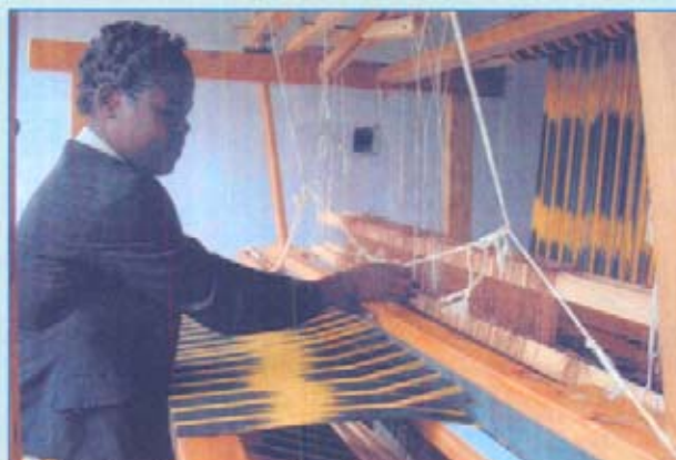
Fabric handloom weaving in Kisumu district.