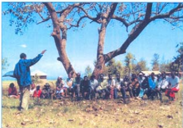
A public meeting with farmers of Kiarukungu irrigation scheme.

The focus of the project is domestic horticulture because 96 per cent of the production by volume is consumed locally, while only 4 per cent is exported. Through past JICA initiatives, the constraints faced by domestic horticulture farmers were identified. This project will focus on increasing the volume of production, improving the quality of products and facilitate marketing of the produce. Infrastructure, especially impassable sections of the roads in the project target areas will be improved to facilitate movement of inputs into the project area and transportation of the produce to the markets. The project commenced in November, 2006 in collaboration with Ministry of Agriculture and Horticulture Crops Development Authority (HCDA). It will be implemented over a period of three years. The target districts include Nyandarua, Bungoma, Trans-Nzoia and Kisii Central. The districts were selected based on the current crop production, existing potential, target population, presence of interventions by other development partners and poverty levels.