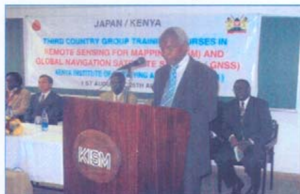
Hon. Kivutha Kibwana, Acting Minister for Lands, addressing participants during the opening ceremony of the Third Country Training at KISM.

By using KISM facilities, JICA has from 1998, been annually holding month-long Geographic Information Systems (GIS) course, Global Navigation Satellite Systems (GNSS/GPS) course and Remote Sensing for Mapping course for officials working for National Surveying and Mapping Agencies in Eastern and Southern African countries. Since its inception, the programme has trained over 200 officers from 16 countries in Eastern and Southern African Region.