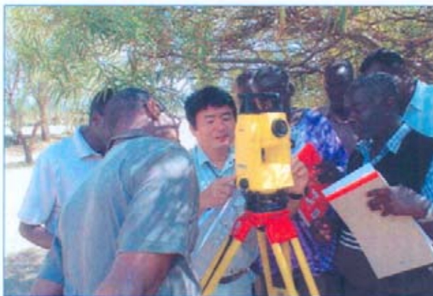
Irrigation and drainage training at field level.

The project has embarked on training of irrigation and drainage department staff both in classroom and field level.