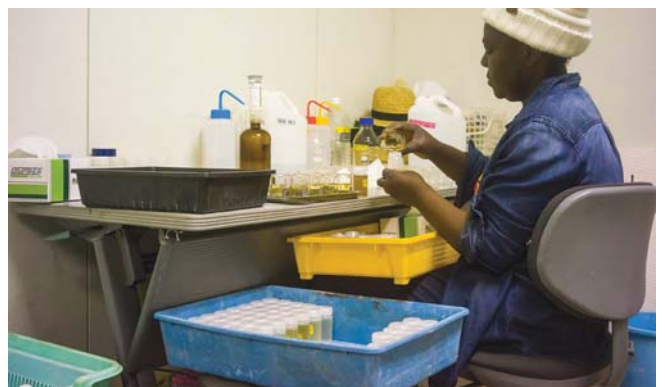
Preparing samples for her research at JKUAT

“African Union - african innovation - JKUAT And PAUSTI Network Project” is a joint initiative involving Jomo Kenyatta University of Agriculture & Technology (JKUAT), Pan African University - Institute of Basic Sciences, Technology and Innovation (PAUSTI) which was established by African Union Commission (AUC), and JICA to strengthen the knowledge and skills in the fields of Agriculture, Engineering, Science and Biotechnology of both PAUSTI and JKUAT students and staff. After the project started in 2014, next generations of scientists who obtain a PhD in Japan or strengthened in JKUAT and alumni from JKUAT/PAUSTI begin to contribute to the Africa’s development using their knowledge and skills acquired through this project.