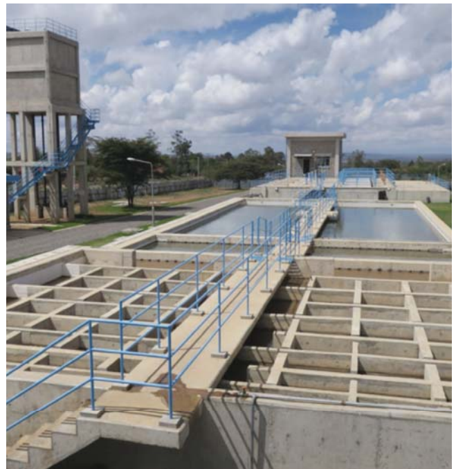
Narok Water Treatment Plant

The provision of safe water contributes for Kenya's attainment of vision 2030 and global issues and challenges on Pillar 3 of Nairobi Declaration.