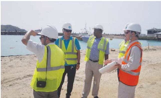
Technical Survey of Construction Site on the Expansion of Fish Port in Seychelles

As the second most important sector in Seychelles, fisheries sector contributes 20% of GDP and employs 17% of the population. JICA has been supporting development of artisanal fishing through construction of fish landing facilities and installation of storage equipment in collaboration with Seychelles Fishing Authority (SFA). The ongoing Grant Aid Project for Construction of Artisanal Fisheries Facilities in Mahe Island (Phase 2) is planned to expand the industry by catering for more and larger fishing vessels. JICA has also continuously supported capacity development of Seychelles government staff through training in Japan. In October, ex-trainees formed an alumni association.