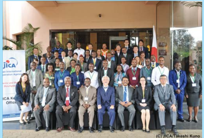
ABE 4 th Batch Send-Off Ceremony

And now, this is also the time to encourage the returnees to contribute the aim of ABE as a bridge between two countries in various ways. JICA Kenya will closely follow them up to strengthen our linkage.