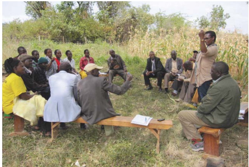
Forestry Farmers’ Field School

This project consists of five components, one of which is Pilot Implementation of forestry activities. Under this component, Kenya Forest Service (KFS) is running Farmer Field Schools to familiarize sustainable forest management to farmers.