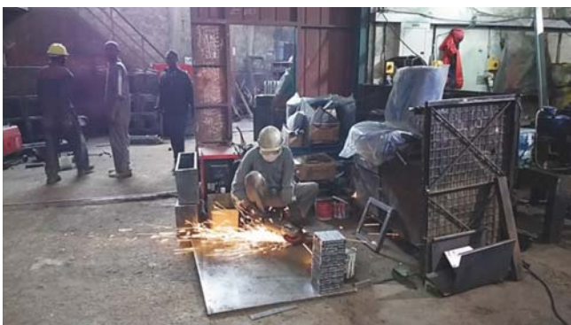
Kenya Coach Industries (KCI)

Industrial development, especially SMEs, is one of priority area for JICA’s economic sector in Kenya. JICA has been implementing “Project on Industrial Human Resource Development for Industrial Development” in conjunction with Kenya Institute of Business Training (KIBT). The objective of the project is to enhance productivity and competitiveness of SMEs through the improvement of business management process (KAIZEN, 5S, Marketing and Sales and Financial management). The Project has so far yielded positive results especially with regards to the provision of consultation service to SMEs by KIBT and related institutions. Further, JICA collaborates with Toyota Kenya Academy for the provision of Japanese quality training course in the field of construction and agriculture machinery.