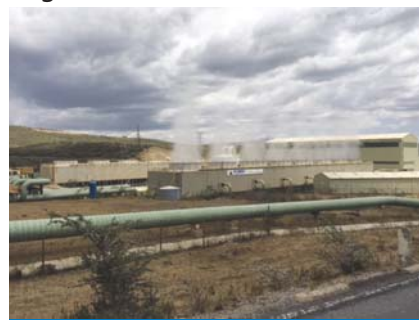
Olkaria Geothermal Power Station 1 Unit 4,5

JICA will be a strong contributor for Kenya's stable power supply continuously through development and strengthening of the power plant, transmission line and technical capacity of the engineers.