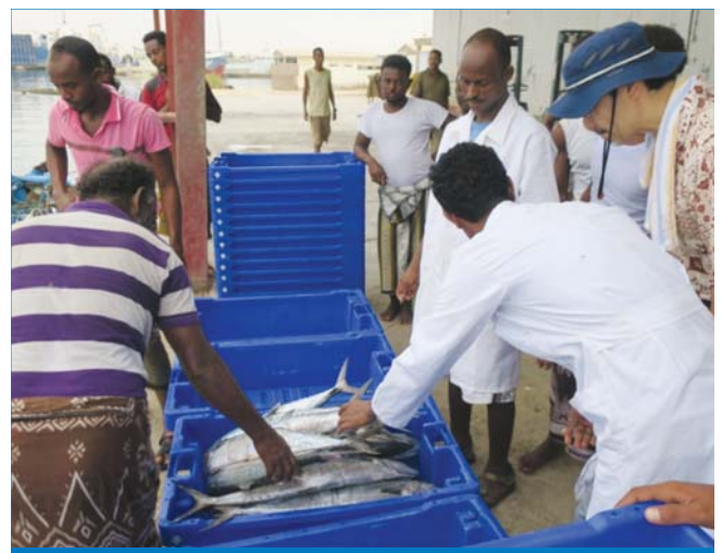
Training in Data Collection Survey at Massawa

The Data Collection Survey on the stock assessment of marine resources was held in July and November 2017 in Massawa, Eritrea. The participants from Ministry of Marine Resource learned method to assess and periodically monitor the stock of marine resources by utilizing CPUE (Catch Per Unit Effort) method.