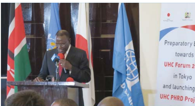
Dr. Cleopa Mailu, Cabinet Secretary, Ministry of Health, at the event

In November 2017, a preparatory event towards the UHC Forum 2017, held in Tokyo in December 2017, was organized in Nairobi. Key note speakers included the Japanese Ambassador to Kenya, and the Cabinet Secretary for Health. Government of Kenya expressed its commitment to accelerate health system reform for attainment of UHC.