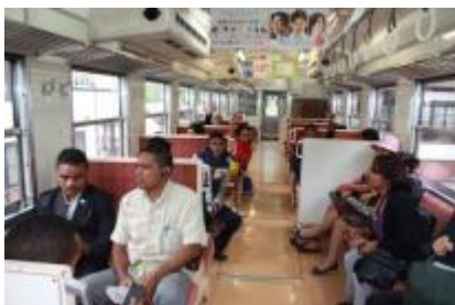
Traveling by train