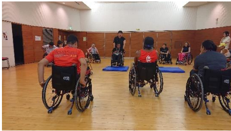
Instruction of Sports Introduction through Daily Wheelchair

JICA encourages international exchanges between JICA participants and the local communities. Participants are kindly requested to bring their national costumes, small gifts and visual aids, such as videos and photographs, to introduce their countries.