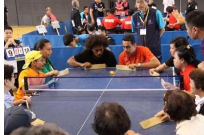
Takkyu Volley Tournament