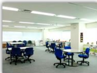
JICA Plaza Tohoku