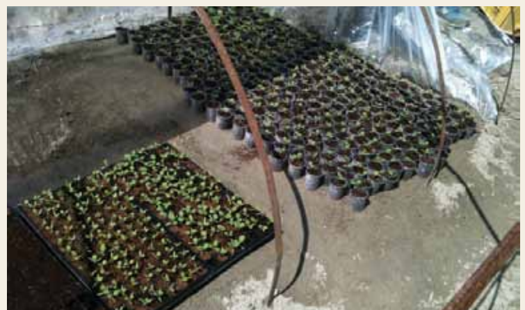
Seeds and plants ready for grafting