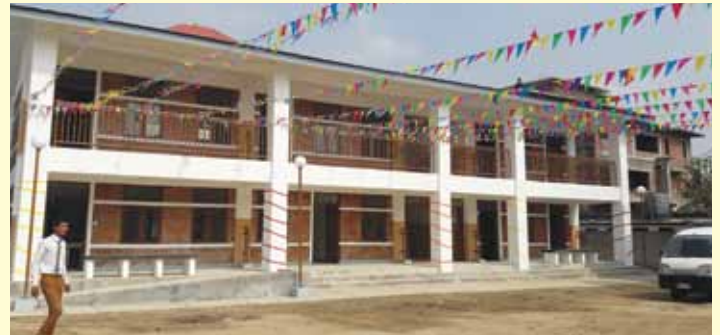
Shree Tika Vidhyashram Secondary School, Sanepa, Lalitpur