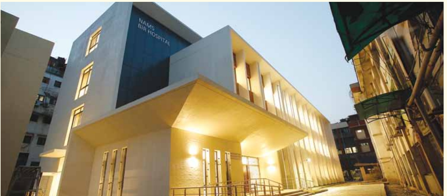
Bir Hospital, Kathmandu