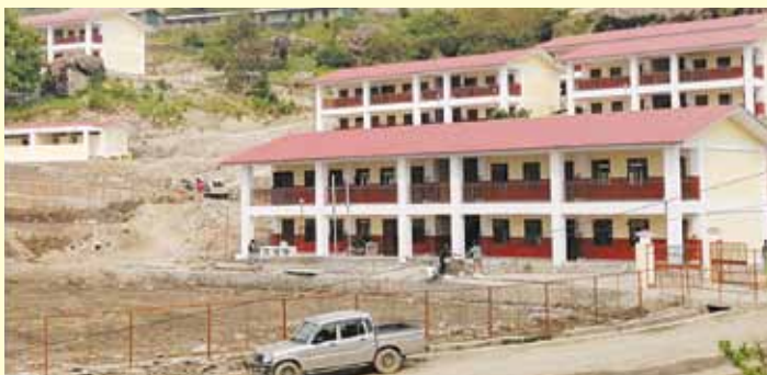
Shree Himalaya Secondary School, Barpak, Gorkha

Altogether 236 schools are being built at a total cost of JPY 14 billion (about NPR 12.7 billion) to support the reconstruction of disaster resilient schools in Gorkha, Dhading, Nuwakot, Makwanpur, Rasuwa and Lalitpur Districts, based on the earthquake-resistant type design guidelines formulated by JICA under the principle of “Build Back Better (BBB)”. The rebuilt schools are expected to serve as potential regional hubs for improving the quality of education.