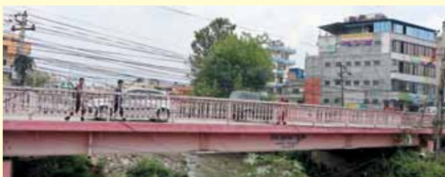
Dhobi River Bridge, Anamnagar, Kathmandu

The bridges until date have been providing efficient services to the commuters thereby contributing to the improvement of regional transportation and economic development in Kathmandu Valley.