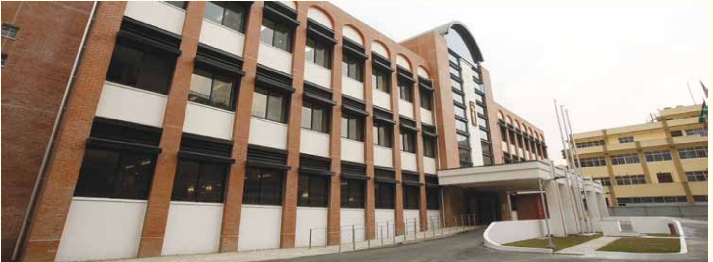
Paropakar Maternity and Women's Hospital, Thapathali, Lalitpur