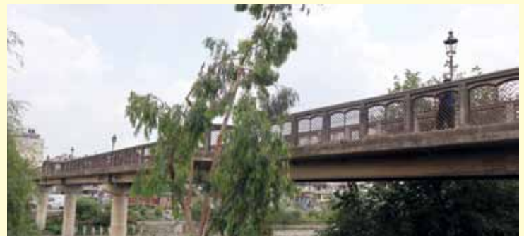
Bagmati River Bridge, Sankhamul, Lalitpur