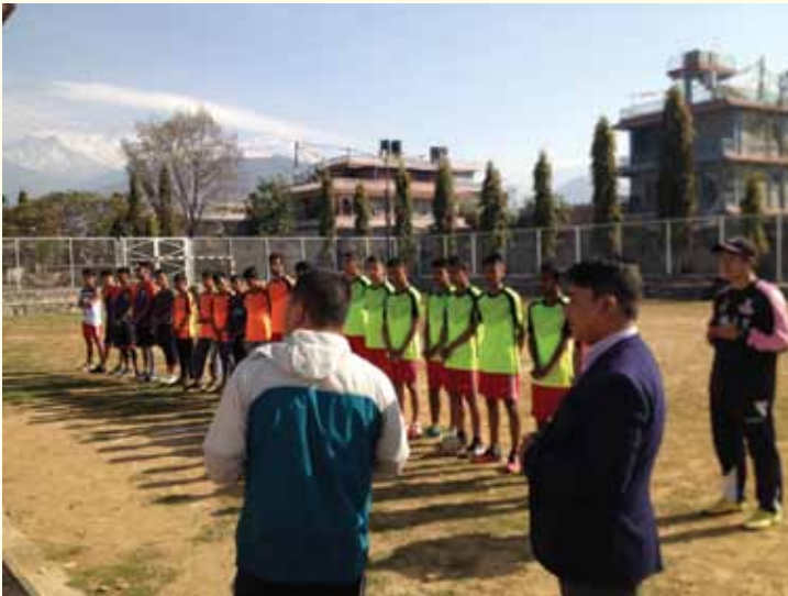
Greeting program organized by Nepal Handball Association for the visitors