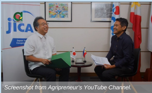
Screenshot from Agripreneur's YouTube Channel.