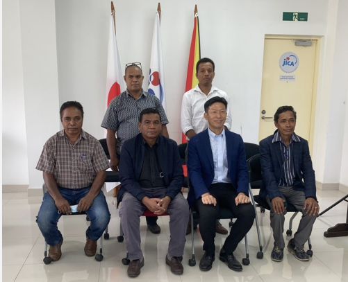
New Structures and CR of JICA Timor-Leste