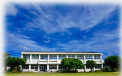
KIKAI Institute for Coral Reef Science, Japan