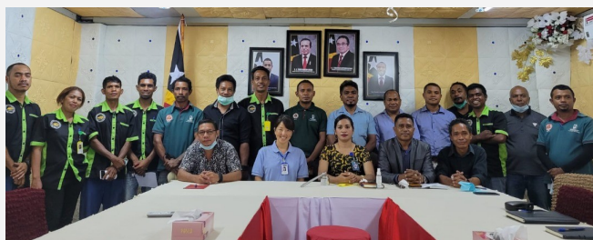
JDRAC and IGE Opening Ceremony for the Training

and maintenance for heavy machines the IGE staff.