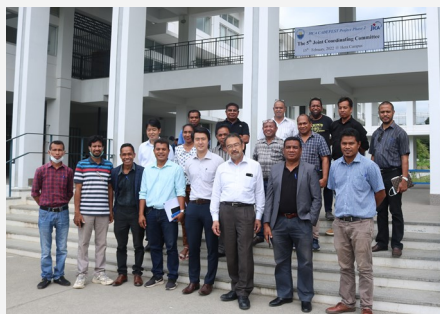
JICA Mission and Lecturers

JICA mission from HQ, visited the Faculty of Engineering, Science and Technology, UNTL from 14-17th February 2022. They visited each department to observe the situation of the education and research environment in the faculty. The mission also had discussion with JICA long-term trainee alumni who are working in government institutions to exchange their views on the future strategic plan of the faculty.