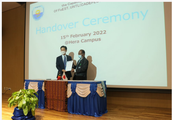
Handover Signing Ceremony

The equipment including the scanning electron microscope (SEM) for geology and petroleum Department which is the first installation in the country ,Timor-Leste.