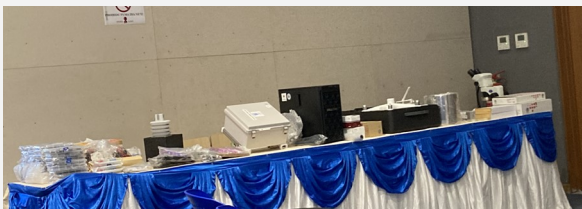
The provision of equipment

We expect more outcomes from the utilization of these equipment in the faculty and the society in Timor-Leste.