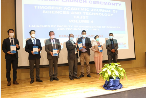
TAJST Volume 4 Launching Ceremony

Timorese Academic Journal of Science and Technology (TAJST) volume four is launched on 15th February, 2022 during the 5th JCC meeting. In this TAJST Volume four, 19 papers are submitted from lecturers of the faculty of science and technology, UNTL. Currently, total academic journal papers which produced by the lecturers of the faculty have been reached 112 papers from 2016 to date.