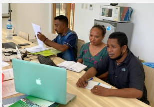
Lectures of Geology and Petroleum Department had online meeting with KIKAI Institute

Geology and Petroleum department had discussion with KIKAI Institute for Coral Reef Science, Japan. KIKAI Institute is the Research Institution, which provides the environment education program and foster students and young promising science researchers.