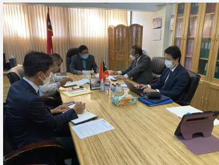
Meeting with Minister of Petroleum and Mineral Resources