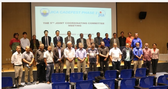
JCC Members of CADEFEST Project II