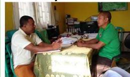
Interview in MAF Ainaro (Oebaba IS)