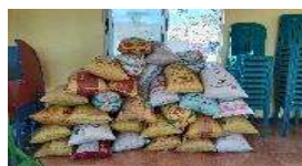
Collected paddy as contribution

We continued to support the WUA to collect water fee. Many Kabu-we successfully have collected water fees as the above table.