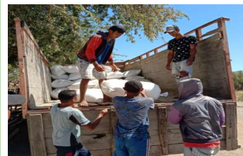
Loading paddy to NLC's truck

Signing contract between farmers group leader and NLC