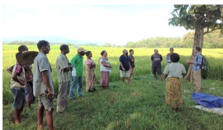
< 4th FFS workshop in Maliana I >

We conducted 4th FFS workshop with MAF extension workers in Maliana1 on March 23, 2021. This session was on pest and disease control also seed maintenance. In total 16 lead farmers including 3 females joined the workshop.