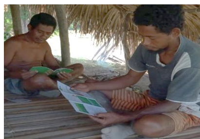
< Explanation on how to apply fertilizer to the farmers by Project staff >