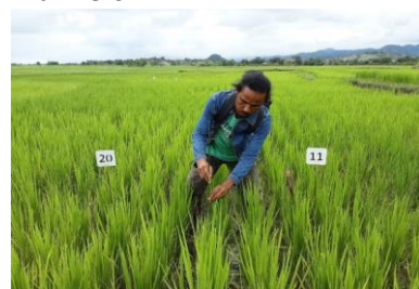
< Growth Monitoring in Buluto >

In Buluto, some farmers are still weeding their fields and we reached 80 DAS growth monitoring stage only for few farmers.