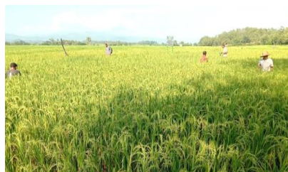
< Demonstration Field in Maliana I >

In Maliana I, most of paddy are getting into flowering stage. This is the time for rice pests severely attack flowering rice, therefore, we sprayed pesticide with the farmers. Also, we almost finished 80 DAS (Days After Sowing) growth monitoring survey. Relatively good number of tillers, which around 300 was observed.