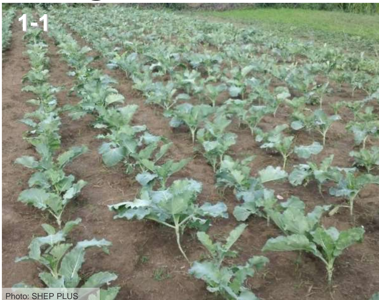
Kale (Sukuma Wiki)