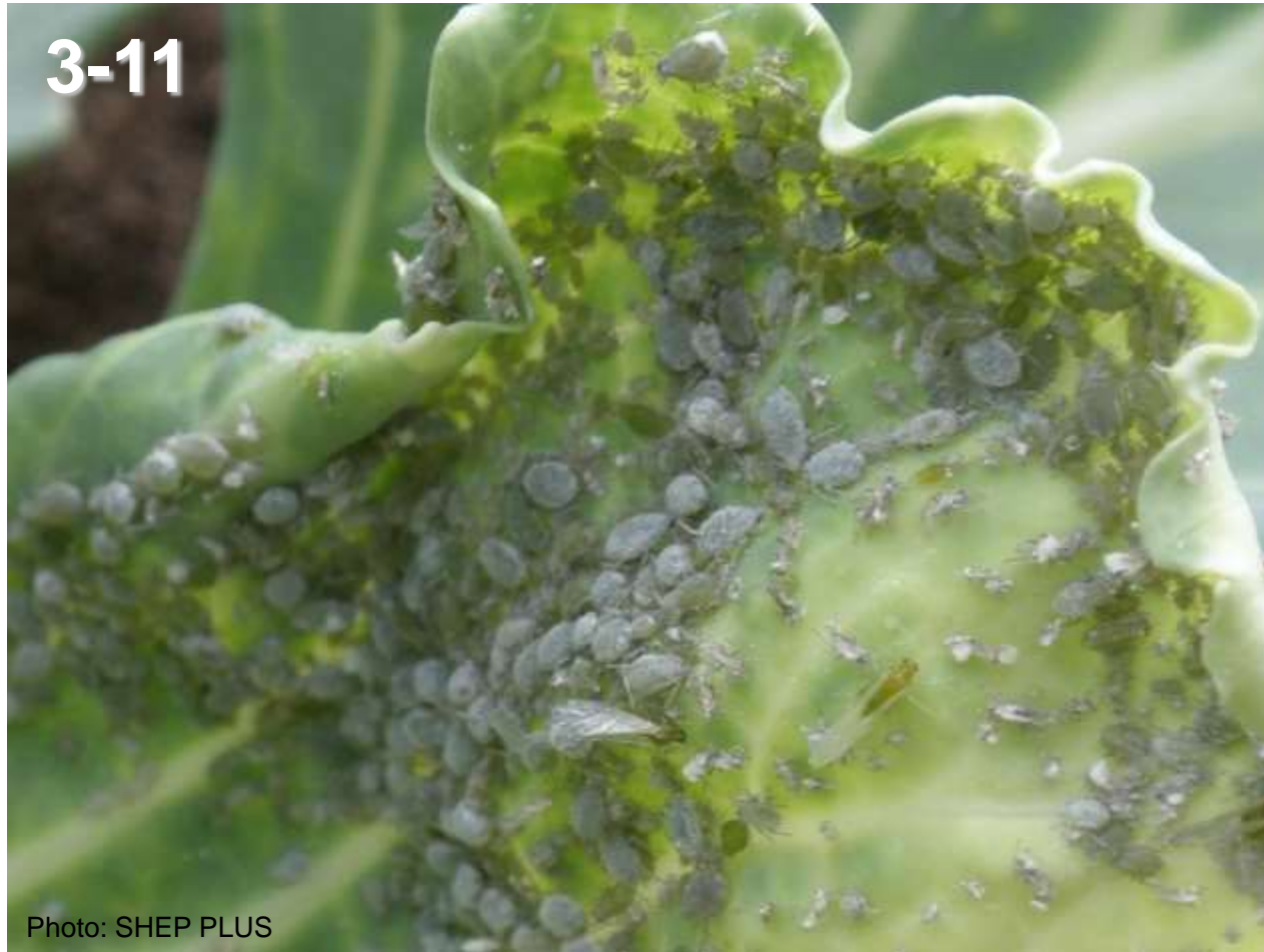
Underside of a leaf infested with Aphids