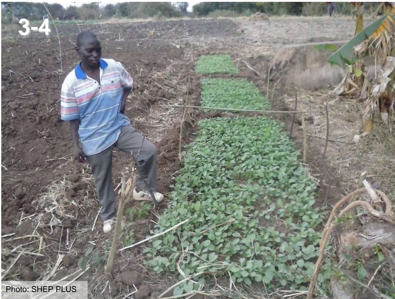
A Kale nursery