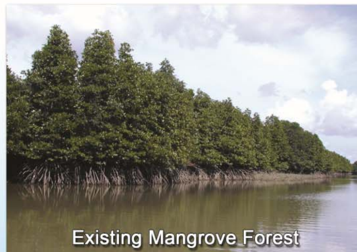
Existing Mangrove Forest