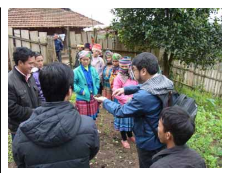
Soil quality (porous and moisture) was checked by hand